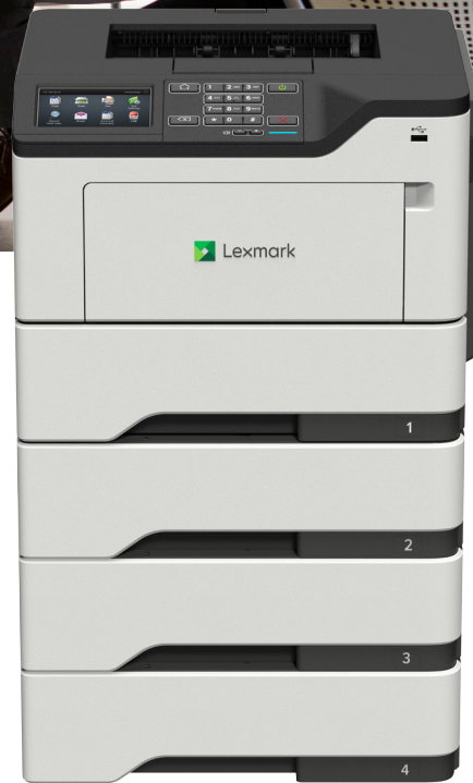
M3250 with optional trays